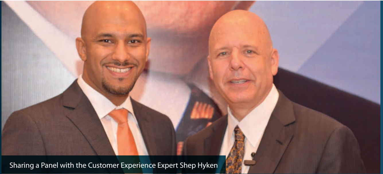
Sharing a Panel with the Customer Experience Expert Shep Hyken

My perspectives have been featured on national radio and television, most local newspapers, local magazines such as The Bahrain Banker, Bahrain This Month and BizBahrain magazine, where I contribute a monthly column on the art of speaking.