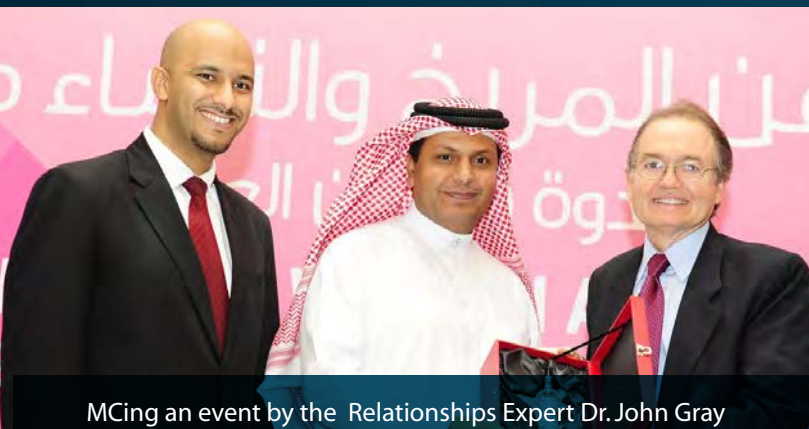
MCing an event by the Relationships Expert Dr. John Gray

And finally, one time I pulled the trigger on a punchline and the audience laughed continuously for 14 seconds. I enjoyed that immensely and actually have it on video!