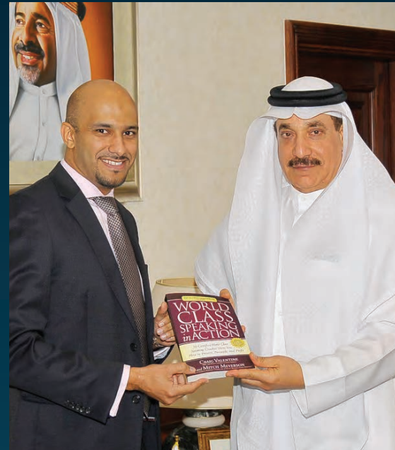
With H.E. Mr. Jameel Bin Humaidan ( Minister of Labor )